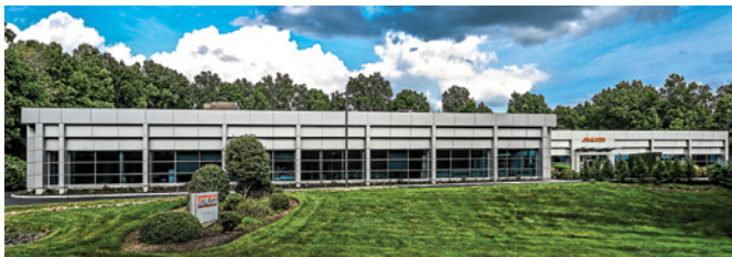
Emuge Corp. newly expanded facility.

Both tool manufacturing and reconditioning is now available at the West Boylston, MA facility.